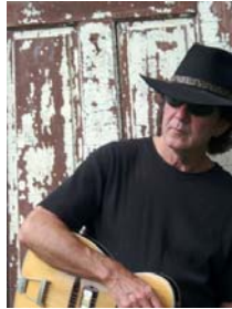
Tony Joe White

Tony Joe White Not all songwriters can deliver their own goods but Tony Joe White sure can. He's penned songs for Elvis, Brook Benton, Dusty Springfield, Jerry Lee Lewis, and Tina Turner – but no one delivers them quite like Tony Joe. His slow, Southern, baritone coupled with his swampy, fuzzed-out Stratocaster antics make for an unforgettable show. BSC caught up with the Louisiana Swamp Blues master at one of Memphis' hippest clubs, the HiTone Café.